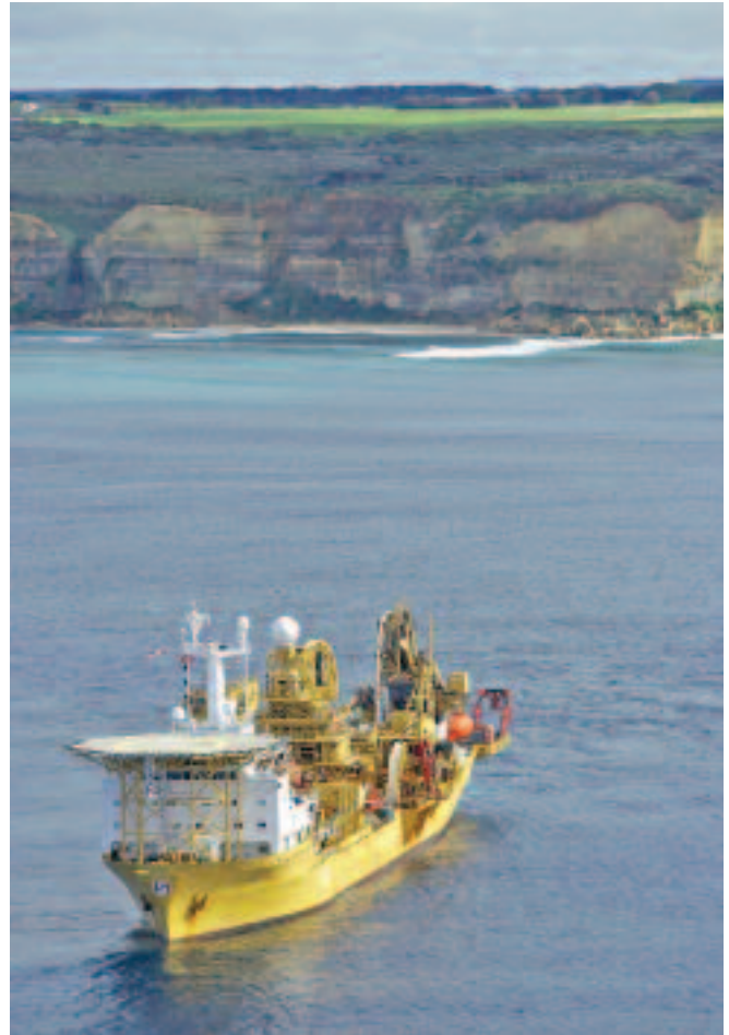
The Seaway Falcon